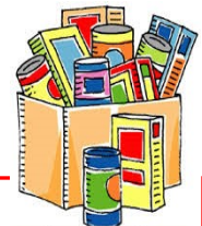
Feeding the Community